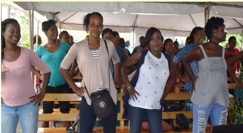
A section of the pregnant women learning the importance of exercise during pregnancy.

An antenatal health fair, dubbed PREGMATE, Pregnant Mothers Advancing Through Education, by the Manchester Midwives Association and the only one of its kind in Jamaica, has been making great strides in empowering pregnant women to take charge of their reproductive health.